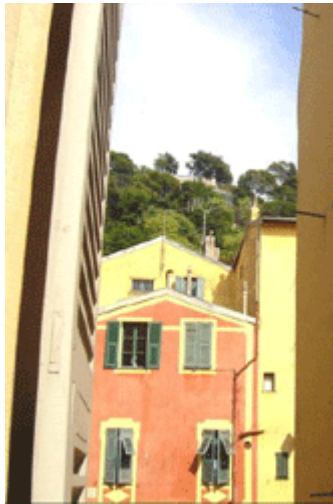
View of the Chateau Hill looking left from each bedroom window