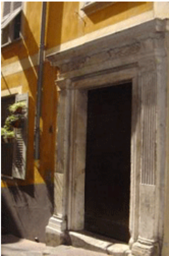
Majestic front door to the apartment building