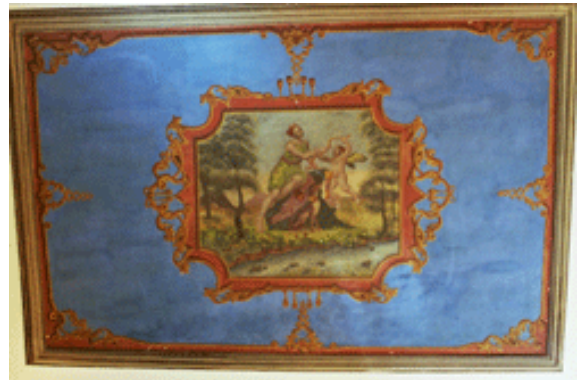
Fresco painting on the ceiling in the lounge. It is estimated to have been painted around 1750